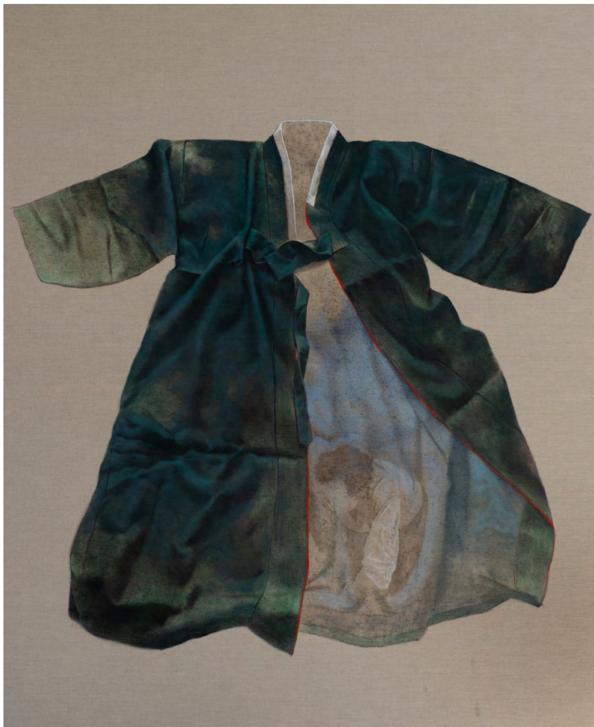
Abrigo 2025 Oil on linen 170 x 140 cm