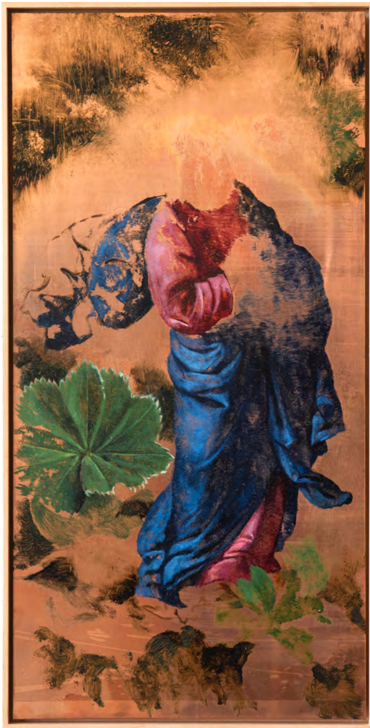
Alchemilla 2025 Oil on copper 50 x 25 cm