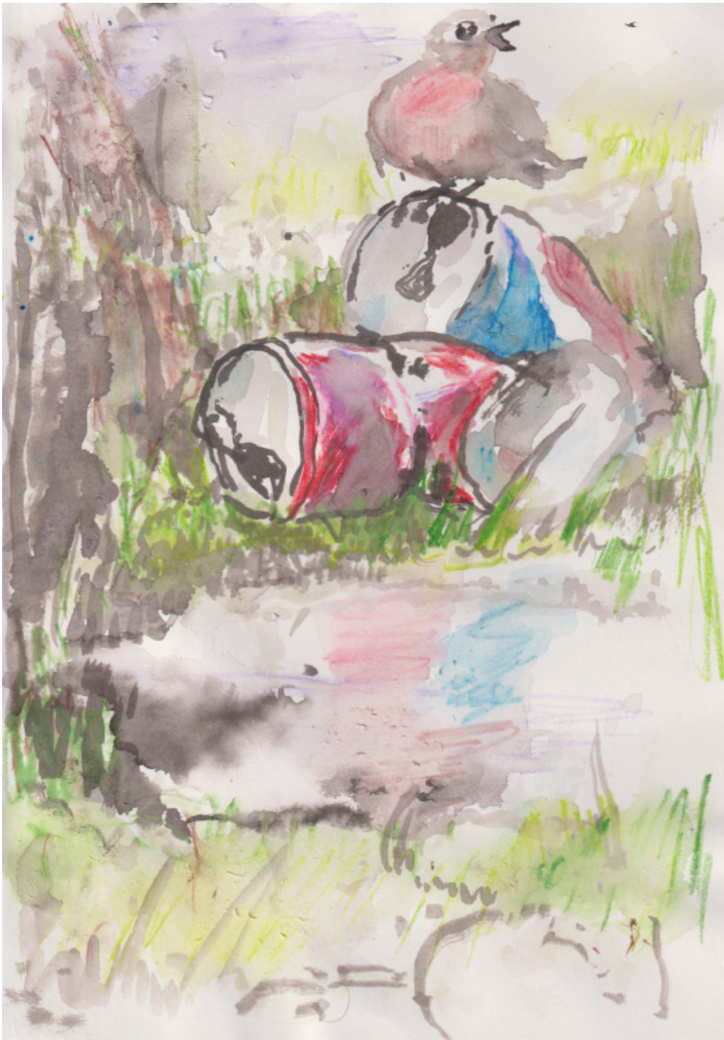
Pepsi Cola Kehlchen (Pepsi Cola Robin)