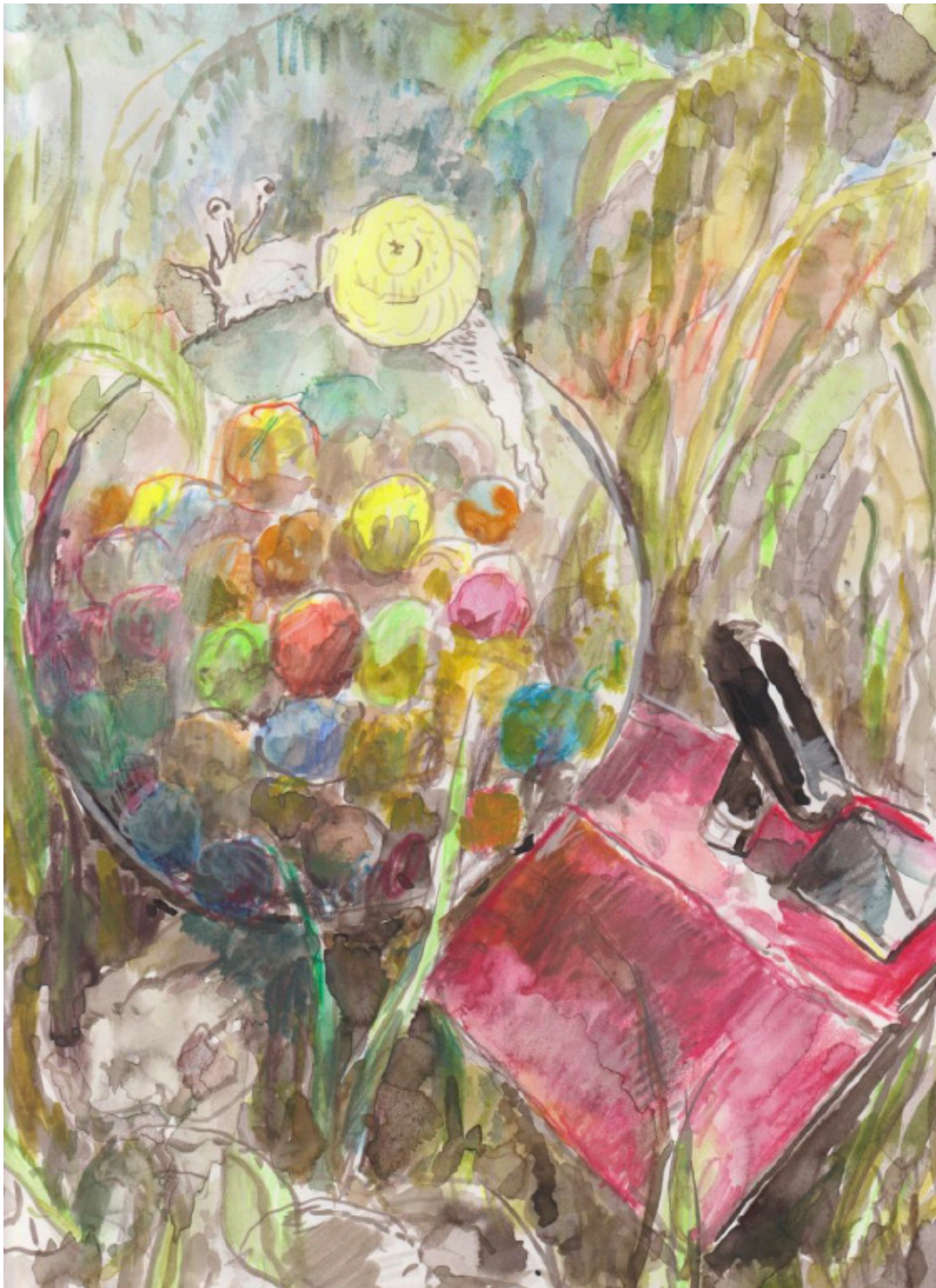
Betthupferl (Unter Anderem Waldmeister) (Bedtime Treat - Woodruff Amongst other Tastes)