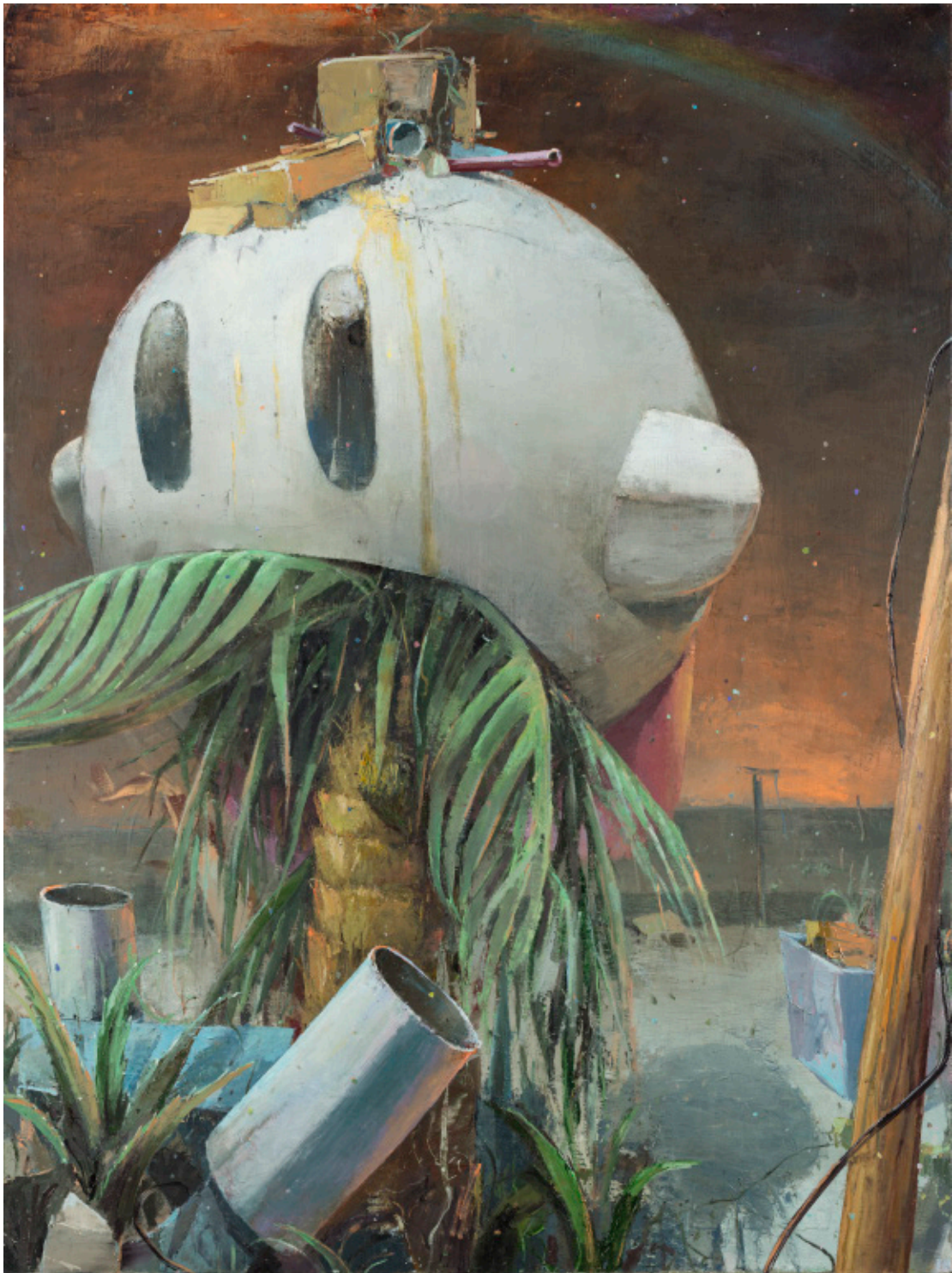
Outskirts 2020-2023 Oil on canvas 200 x 150 cm