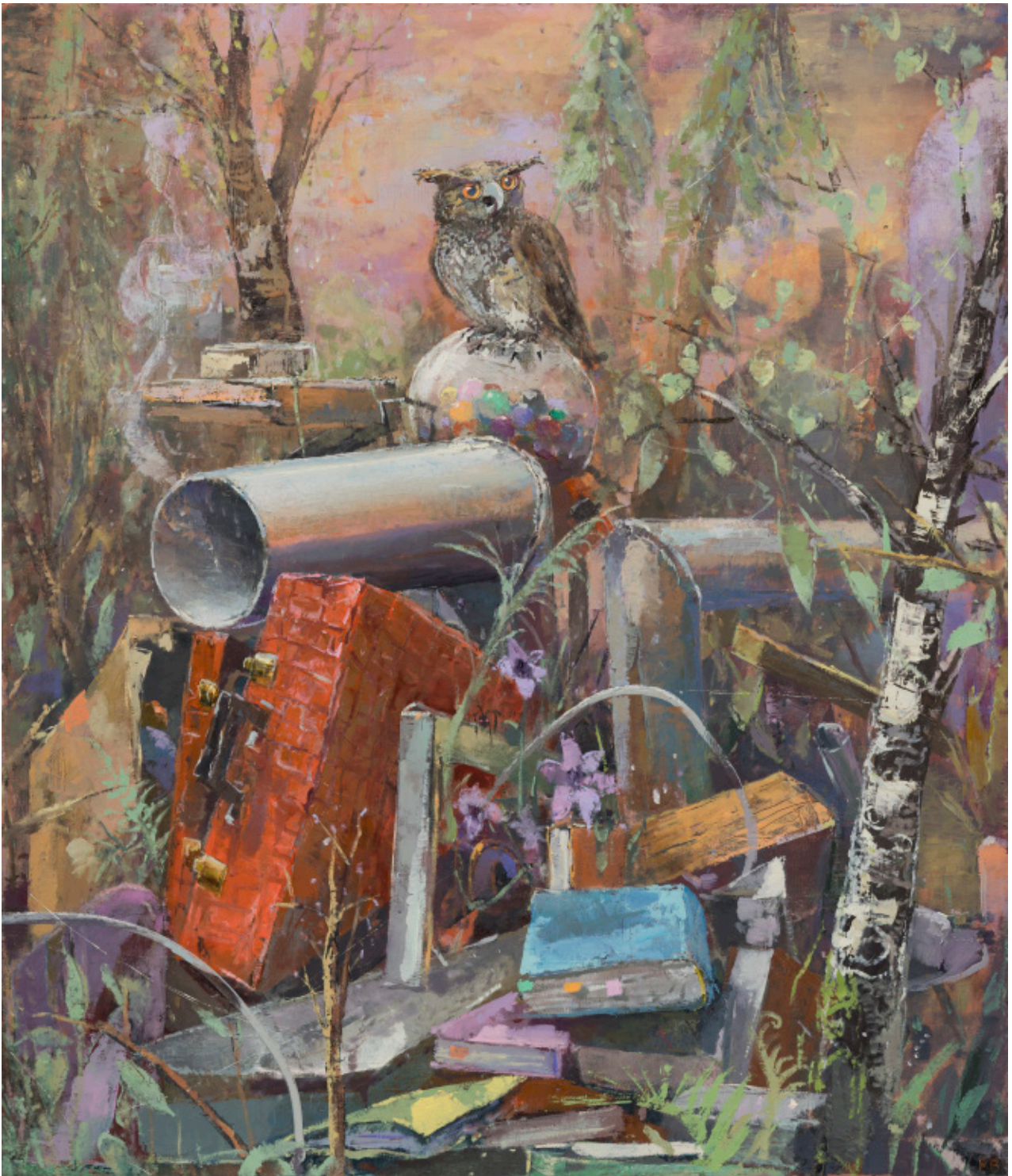
Roter Koffer (Souvenirs D'Amour) (Red Suitcase - love memories)